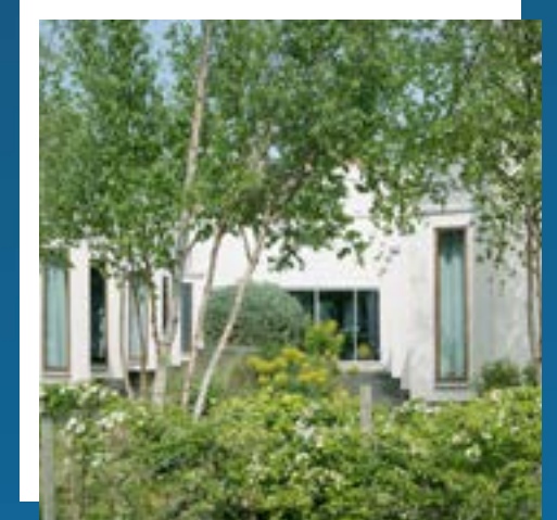
Clock View Hospital, Liverpool, Medical Architecture

“Set in a deprived part of Liverpool, and completed over a decade ago, this elegant mental health facility – along with its landscape of courtyards and communal spaces – shows an extraordinary sensitivity to the way vulnerable people experience the built environment.”