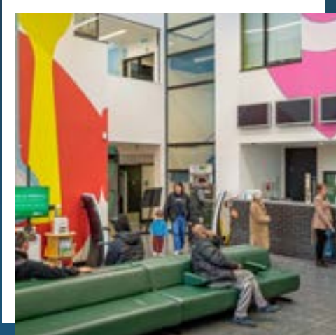
Kentish Town Health Centre, London, by Allford Hall Monaghan Morris

“A deceptively simple building that was way ahead of its time, Kentish Town Health Centre is attracting renewed interest from politicians as a model for devolved health provision. On its completion in 2008, it was clear that this was something special. Over the years it has gone from strength to strength.”