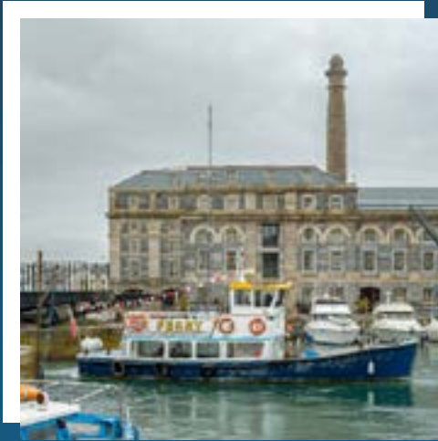
Mills Bakery, Plymouth, by Urban Splash & Gillespie Yunnie Architects

“A 200 year-old nationally important building that was running out of time, has been magnificently restored thanks to the integrity and creativity of its new custodians. In the 15 years since its rebirth, it has generated substantial social and economic benefit for its community and for its city. This is regeneration at its best.”