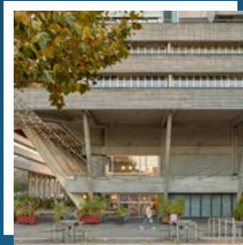
National Theatre NT Future, Central London , by Haworth Tompkins Architects

“In the 50 years since it was built the National Theatre has had to evolve to reflect the changing expectations of theatre and audiences, and the evolution of the South Bank. Haworth Tompkins’ intelligent and sensitive interventions have been pulled off with aplomb and will set the stage for the next 50 years.”