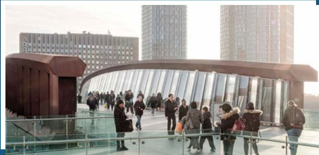
Stratford Town Centre Link, East London, by Knight Architects

“Completed in 2012, this key public route has been in heavy and continuous use ever since. Durable, low-maintenance and with a 120-year design life, it stands as testament to the value of robust materials, minimal design – and a sculptural sensibility that injects joy to the daily commute and the civic realm.”