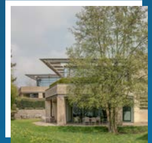
Wessex Water Operations Centre, Bath, by Bennetts Associates

“Completed over 20 years ago, Bennetts Associates’ pioneering project attained targets standards comparable to low carbon targets being set today. The fact that Wessex Water’s chairman says that he ‘wouldn’t change a thing’ shows that this is truly a building that has stood the test of time.”